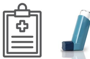
Bring your asthma inhaler/puffer or other regular medication (Prescription Required)