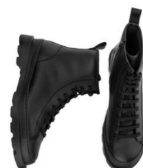
Lace-up ankle high boots