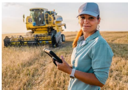
Long sleeve shirt and pants suitable for work.