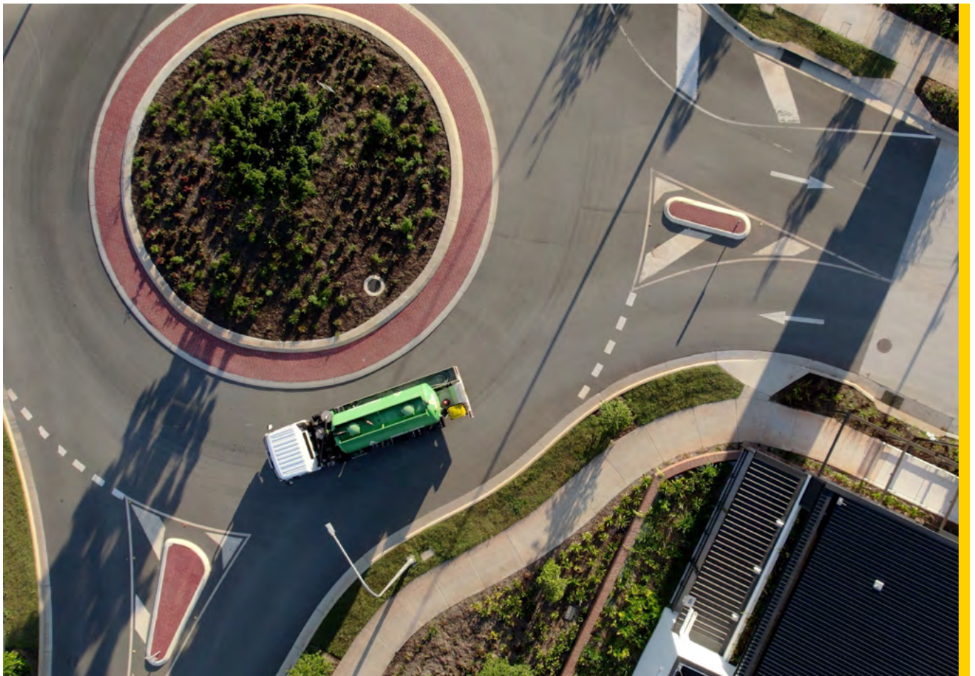
Our Auscol Used Cooking Oil (UCO) collection business is a vital part of our Energy activity. UCO is processed into low-carbon renewable fuel and used in heavy vehicles.

All Directors undertake regular site visits with the purpose of enhancing each individual Director’s knowledge of the business and its operating environment and to engage with operational personnel to assist in their understanding of safety performance and culture.