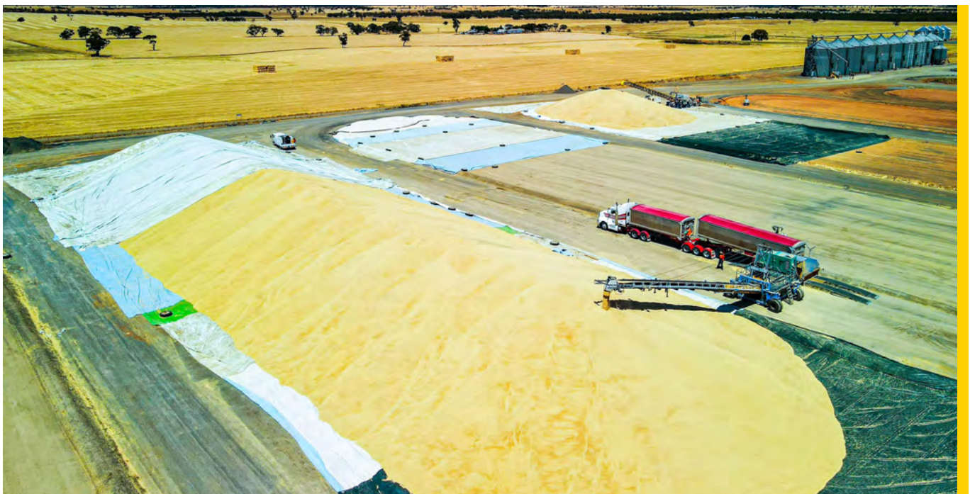
Our regional receival sites along Australia's east coast draw grains and oilseeds from local farms for storage. Both domestic and export markets are serviced from these holdings.

GrainCorp has a review process in place which includes verification testing of content and a review and sign-off by management prior to the Board formally approving the release of material public information, including periodic corporate reports that are not audited or reviewed by the external auditor. The process followed is specific to the nature of the relevant announcement or report and includes review by the relevant subject matter expert and review against source documentation. The non-externally audited components of the Annual Report, Sustainability Report and this Corporate Governance Statement have been verified consistent with this process.