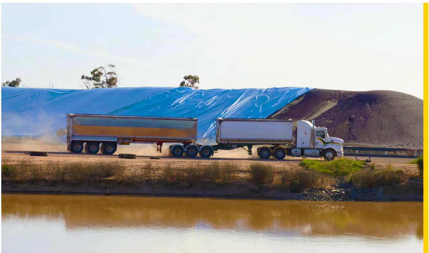
Truck capacities and configurations continue to grow, boosting productivity. Here, a truck containing canola seed leaves our Elmore site in Victoria, headed for our Numurkah crush plant.

Representatives of Internal Audit and other external assurance providers (as required) attend all meetings of the ARC and provide regular reports of progress against the annual program and detail any issues which have arisen.