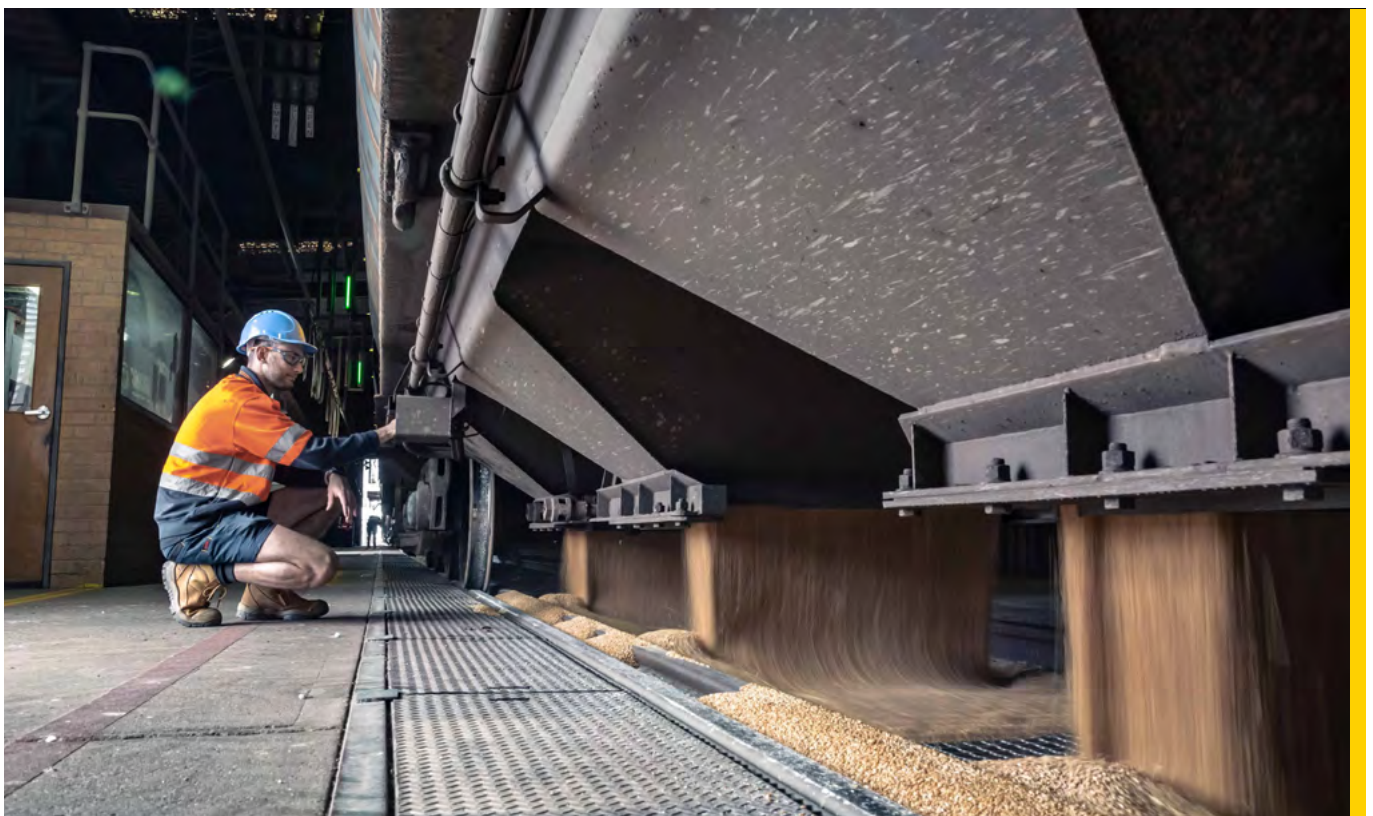
Unloading grain at our Carrington export terminal in Newcastle. Quality Assurance is a key factor in maintaining viable markets.

GrainCorp will not use Company funds, property, goods or services as a contribution to a political party or candidate, or for consideration or favourable treatment. The Company may pay legitimate fees for approved GrainCorp attendees to participate in, or attend as observers, those political events which are assessed to be of relevance to GrainCorp, its industry or operations. Such fees are approved by the Chairman and the MD and CEO. Further detail is outlined in the Company’s Code, which is available on the Company’s website.