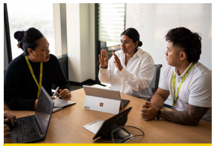
GrainCorp’s approach to DEI is consistent wherever we operate.