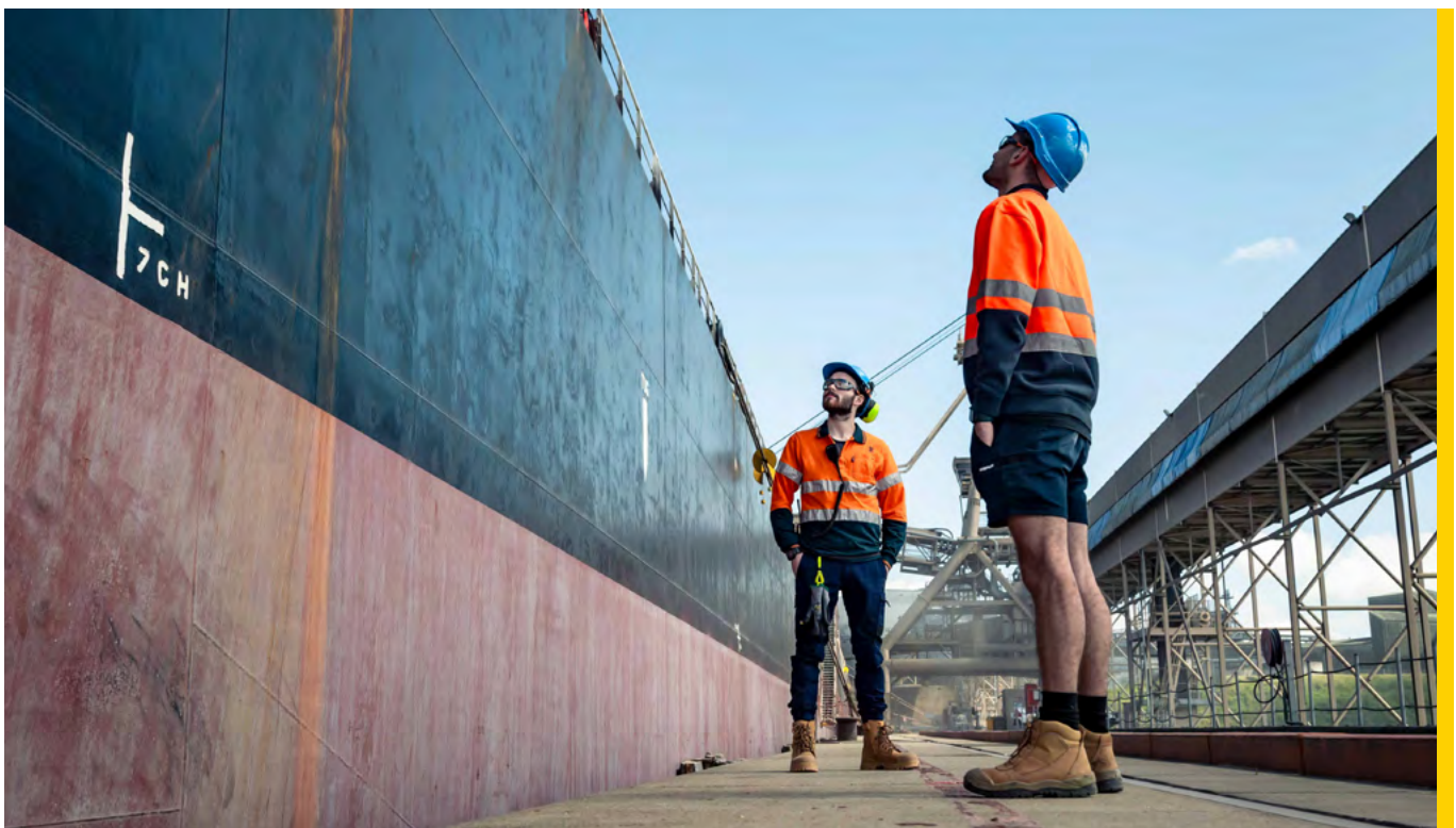
Grains and oilseeds from growing regions across Victoria are transported by road and rail to our Portland export site, to be shipped around the world.

GrainCorp’s Board has adopted an External Auditor Independence Policy ( Independence Policy ) to govern the independence of the external auditor. The Independence Policy places restrictions on the range of non-audit services PwC can provide to GrainCorp and contains a requirement that the lead audit partner be rotated after five years, unless that appointment is extended by agreement under transition provisions.