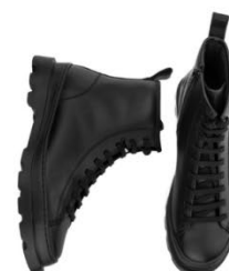
Steel cap boots (lace-up, ankle- high with toe protection)