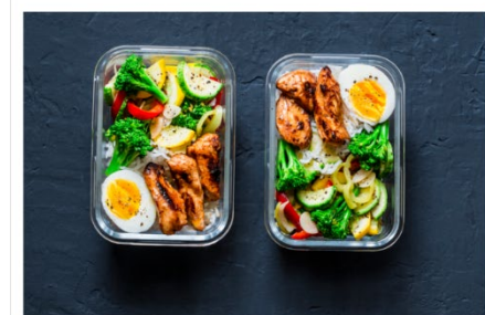
Packed food (shops are not close by)